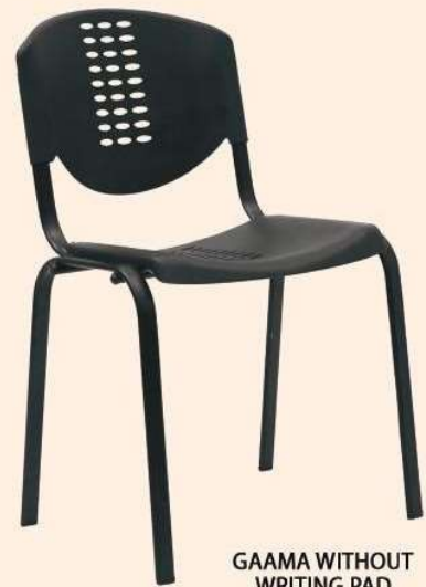
GAAMA WITHOUT WRITING PAD