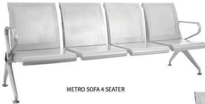
METRO SOFA 4 SEATER