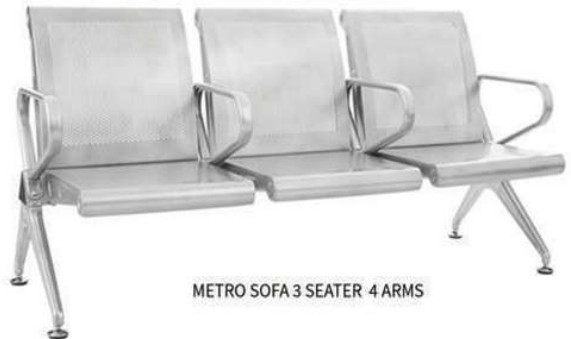
METRO SOFA 3 SEATER 4 ARMS