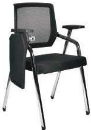
WITH PAD WITHOUT WHEEL

FLIP BACKREST IS MADE OF PP UPHOLESTED WITH MESH. BACKREST IS CONNECTED TO FRAME WITH HELP OF CONNECTOR'S MADE OF NYLON. METAL FRAME IS FOLDABLE & AVAILABLE IN CHROME FINISH. ARM PAD IS ADJUSTABLE ( FRONT & BACK ) SEAT CUSHION ALSO AVAILABLE WITH WRITING PAD + WHEEL