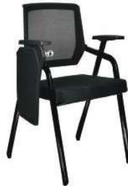
WITH PAD WITHOUT WHEEL

FLIP BACKREST IS MADE OF PP UPHOLESTED WITH MESH. BACKREST IS CONNECTED TO FRAME WITH HELP OF CONNECTOR'S MADE OF NYLON. METAL FRAME IS FOLDABLE & AVAILABLE IN POWDER COATING. ARM PAD IS ADJUSTABLE ( FRONT & BACK ) SEAT CUSHION ALSO AVAILABLE WITH WRITING PAD + WHEEL