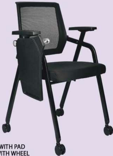
WITH PAD WITH WHEEL