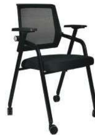
WITH WHEEL WITHOUT PAD