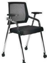
WITH WHEEL WITHOUT PAD