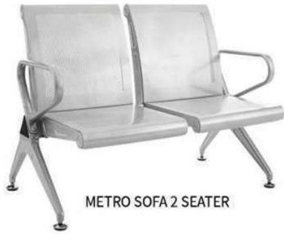
METRO SOFA 2 SEATER