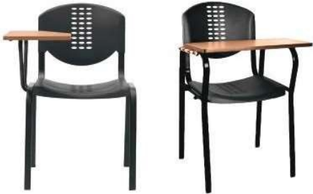
GAAMA WITH HALF - WRITING PAD

SEAT AND BACK PP ONE INCH MS PIPE WITH BLACK POWDER COATED