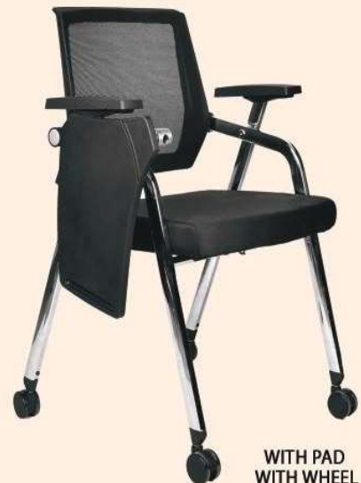
WITH PAD WITH WHEEL