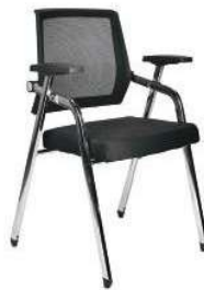
WITHOUT PAD WITHOUT WHEEL