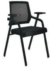
WITHOUT PAD WITHOUT WHEEL